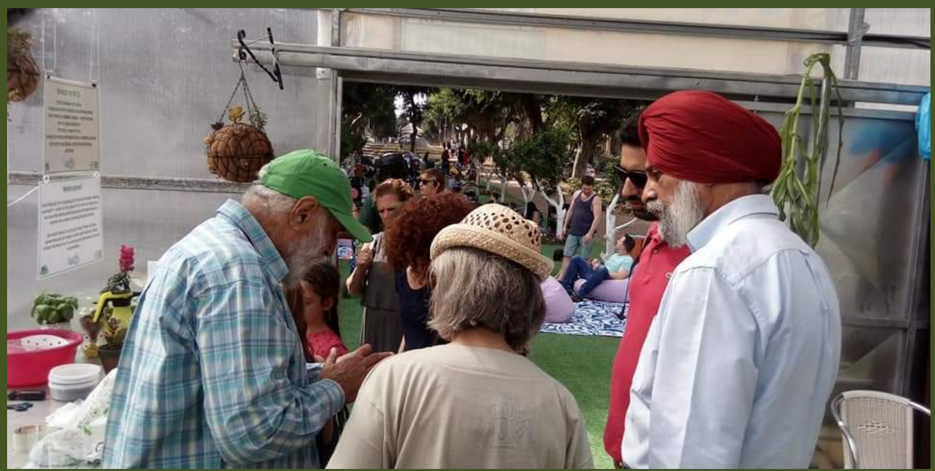
Delegates from Punjab